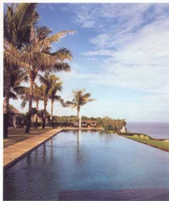
THE BALI The Fabulous infinity pool at The Bali, a five-bedroom villa perched on a sheer bluff 50 meters above the surf breaks of The Bali.

WHEN THE BALI scene blossoms in the season, the island's most desirable villas are beginning to jostle against one another. Many resorts that were remote and exotic (even some are now surrounded by competitors) on rice fields and coconut groves are reported one by one to be replaced by sleek accommodations for foreign visitors. From the dawn of the new century, intergal developers and architects have gone ever further afield in search of quiet, bucolic settings. Many of the best of them are building blue-glass holiday houses—rather than high-occupancy lodgings. The result is a bonanza of choice for visitors, particularly those wishing to stay a week or longer. If you're going crazy (visiting the Bali Five tell you that the good old days are gone forever, that the magic is lost, veritas) into the fields of Canggu, the remote gorge of the Ubud area, the rocky splendor of the Bukit area, at a remote remove from the bustle (crowded beaches, shops, and nightlife, to name a few), in private villa that also exceeds traditional resort lodgings. Here are 10 of our favorites.