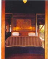
THE BALI Set against the verdant backdrop of the Ayung River gorge near Ubud, Villa Kinara is a stunning upland hideaway for friends and families.

VILLAGEMARA Nothing is more prized in a holiday rental than direct beach access; this one's compound, sunny enough for a big family, occupies a 60-meter stretch of golden sand on Sunar Beach, tucked between a five-star resort (the Hilton) and an ancient temple. Lenses by the villa's pool will see the colorful process of fishing boats curving