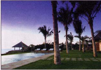
Istana: the ultimate in extravagance

The ultimate in extravagance, Istana has "all the luxuries of a hotel without the other guests", says Matthew Brace in Tatler Travel Guide . There are five double suites in this clifftop villa, plus "mod-cons galore", including a fully stocked bar and wine cellar, a pool, and a hi-tech sound-